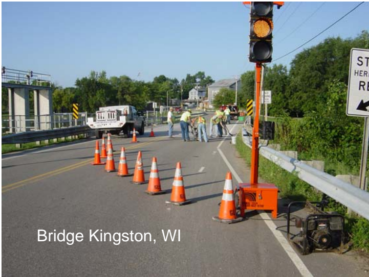
Bridge Kingston, WI