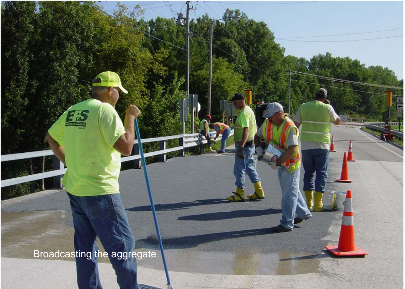
Broadcasting the aggregate