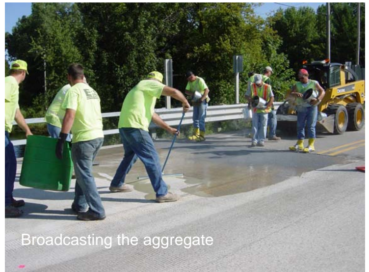
Broadcasting the aggregate