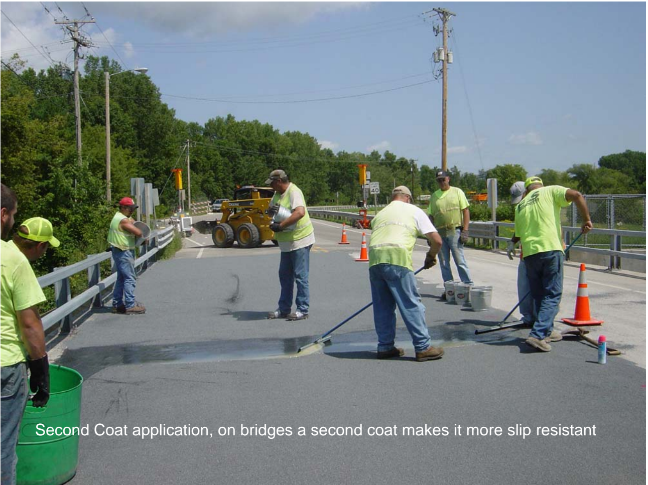
Second Coat application, on bridges a second coat makes it more slip resistant