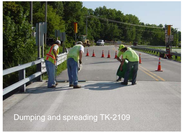
Dumping and spreading TK-2109