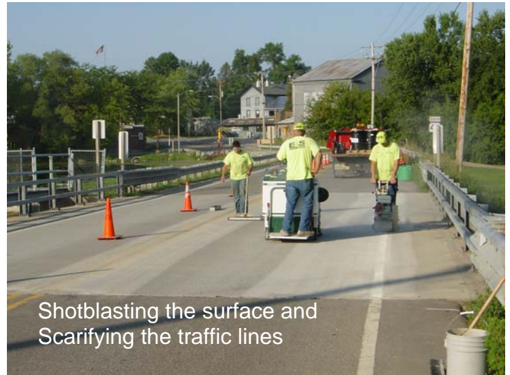
Shotblasting the surface and Scarifying the traffic lines