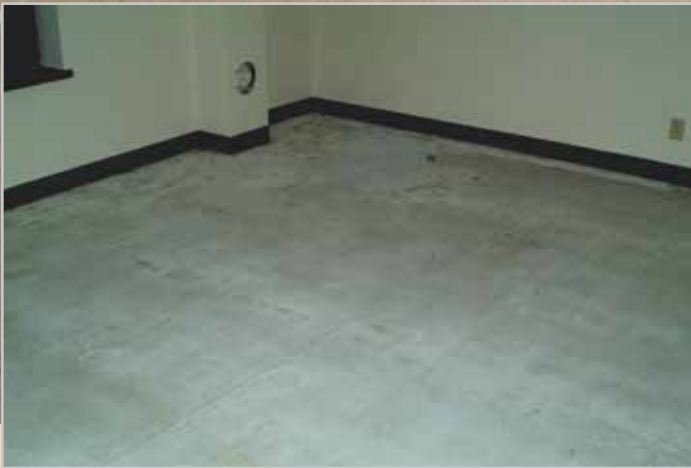
1) Grind the floor

Step-by-step instructions for a successful, beautiful and durable epoxy chip floor.