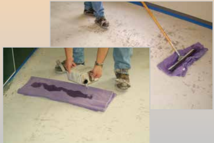
4) Wet towel with MEK and wipe floor