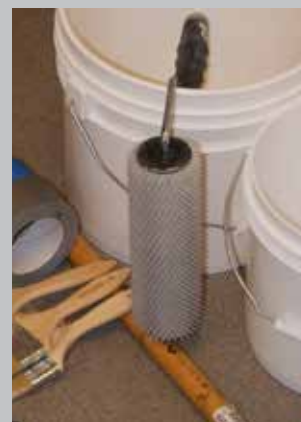
A porcupine roller is a must for breaking any air bubbles.