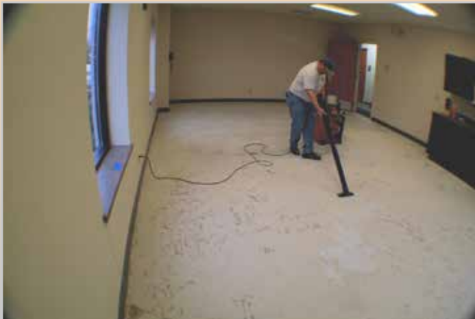
3) Vacuum the floor