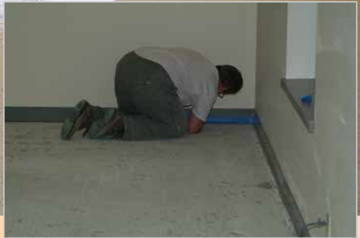
2) Tape the edges